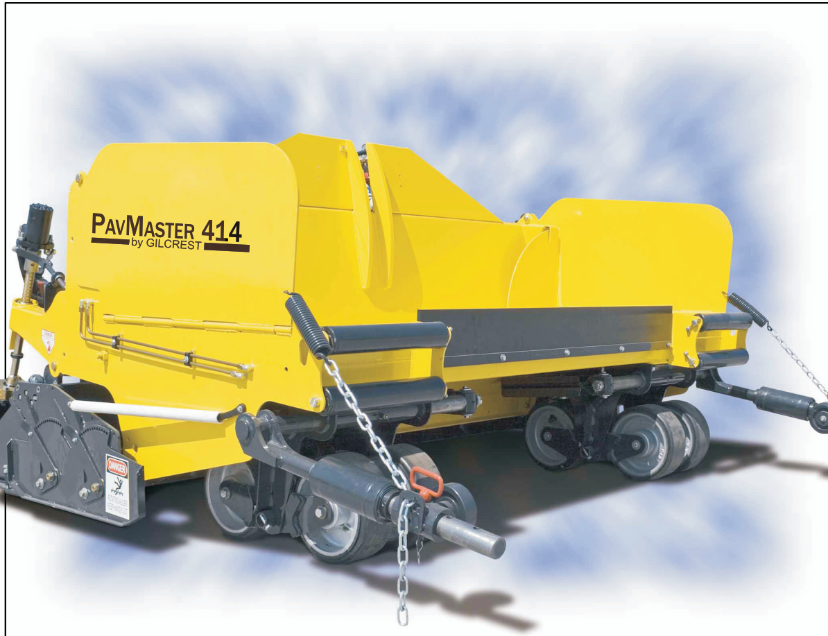
(Paver shown with optional equipment)

What your looking for: Productivity, Reliability, Cost Effective